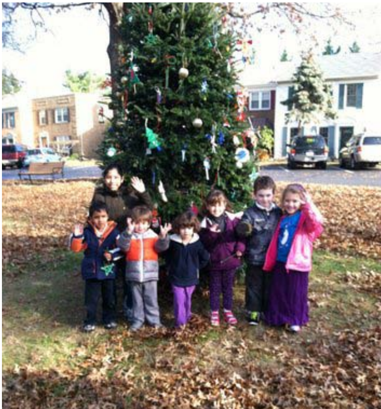
One of the most popular events in Hallcrest, is the annual visit of Santa Claus atop McLean Volunteer Fire Department's antique fire engine. In preparation for this, here is a group of our children who made and hung ornaments for our community Christmas tree strategically placed on the Eldorado oval.